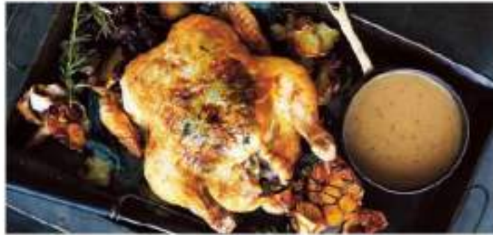
Roast Chicken with Jerusalem Artichokes and Rosemary Gravy