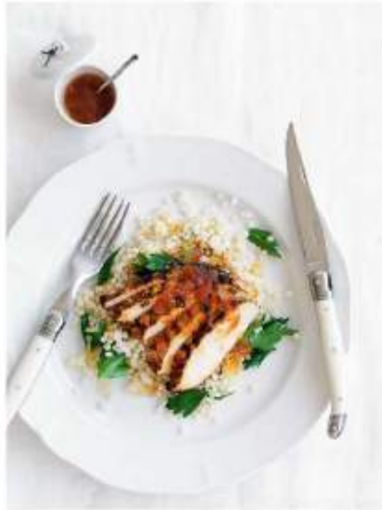
Chargilled Chicken with Grapefruit Marmalade