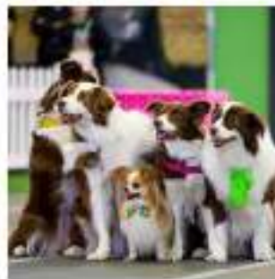
Win tickets to the Dog Lovers Festival Sydney