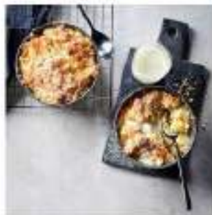
Green Apple, Yuzu Lemon Curd & Coconut Crumble