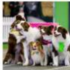
Win tickets to the Dog Lovers Festival Sydney