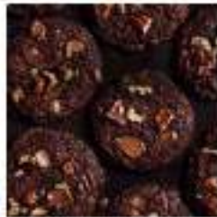
Double Chocolate and Pecan Cookies

DON'T MISS OUT ON MINDFOOD MAGAZINE 2023 FOR THE LATEST DIETARY