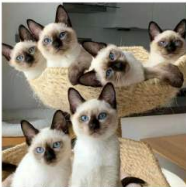
Siamese Cats

Over 200 cats of every colour, size, shape, coat and personality will be available for you to admire, coo at, and, in some cases, pat and cuddle.