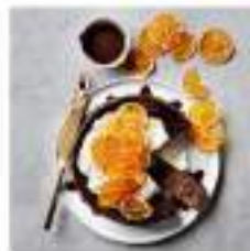
Gluten-Free Flourless Chocolate Orange Cake