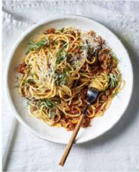
Lamb and Caramelised Fennel Spaghetti Bolognese

DON'T MISS OUT ON MINDFOOD MAGAZINE 2023 FOR THE LATEST DIETARY