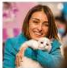
Win tickets to the Cat Lovers Festival