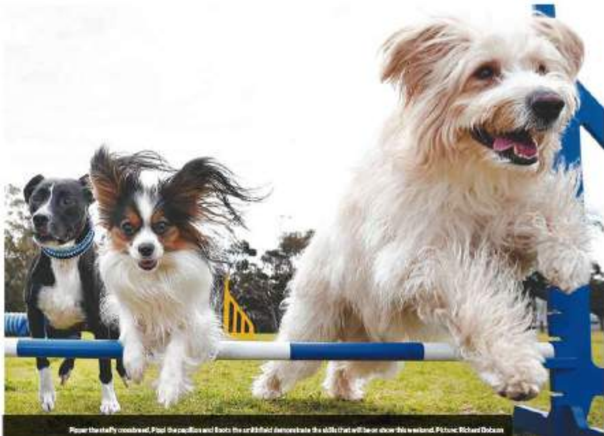
Pipper the staffy crossbreed, Pippi the papillon and Boots the scruffy smithfield demonstrate the skills that will bear show this weekend.

Pipper, Pippi and Boots showed how good they are ahead of the real competition.