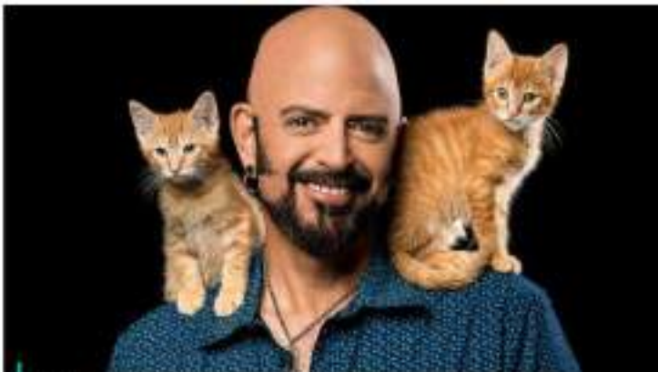
'The Cat Daddy' Jackson Galaxy is an expert on cats.

The cat behaviourist will be at the Sydney Cat Lovers Festival live via satellite this weekend to help pet owners improve our relationship with our cats.