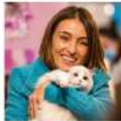
Win tickets to the Cat Lovers Festival