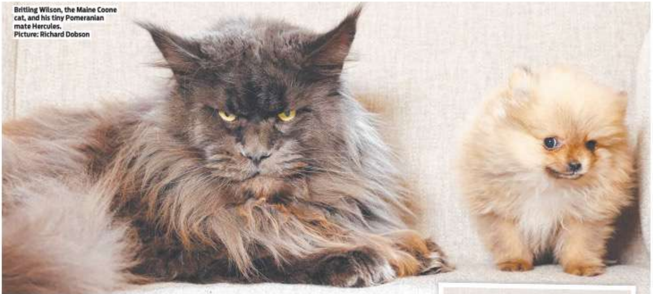
Britling Wilson, the Maine Coon cat, and his tiny Pomeranian mate Hercules.

But on August 26 and 27, cats and dogs will put their differences aside when the two species cross paths as the annual Dog Lovers' festival links up with the first ever cat lovers festival at the Sydney showground.