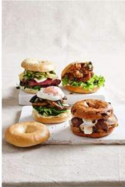
Our Favourite Bagels